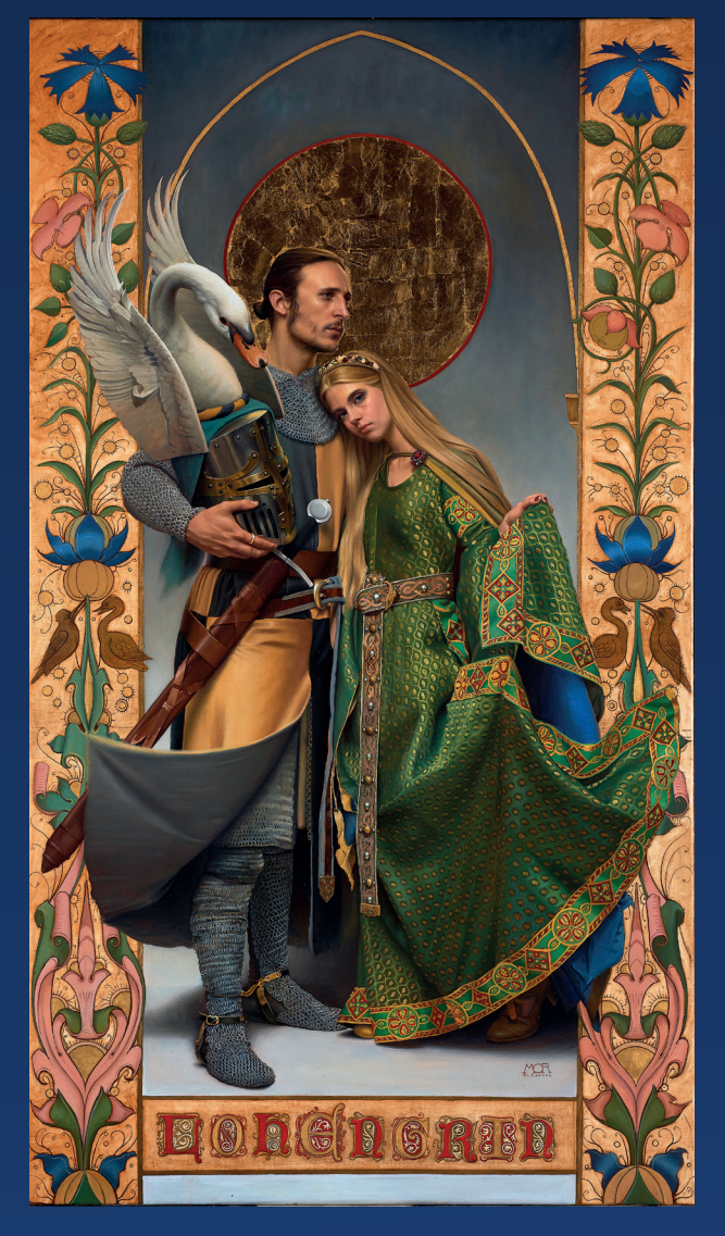
Mikel Olazábal Rodríguez (Álava, España) Lohengrin y Elsa Oil on canvas | 81 x 146 cm

The competition catalogue is available at the Wahnfried Museum